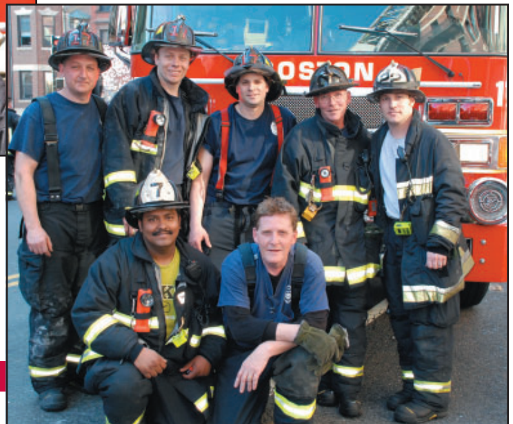
Broadway Engine 7 and Tower Ladder 17