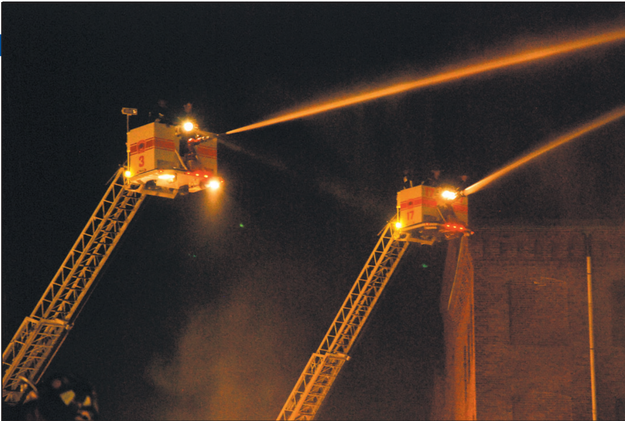
Tower Ladder 3 and Tower Ladder 17 work their guns during the long stand.