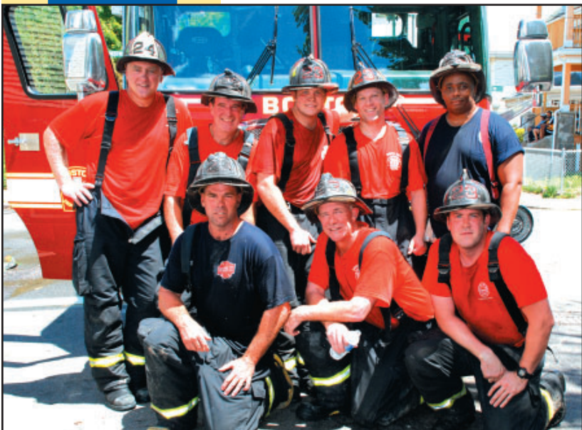
Grove Hall Engine 24 and Ladder 23