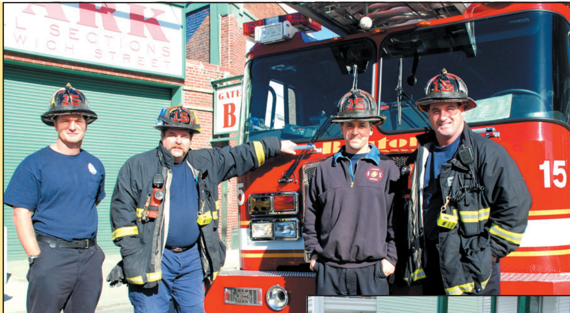
Ladder 15 at Fenway Park