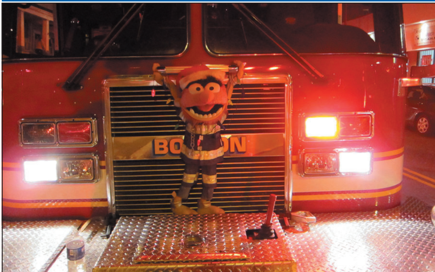
The front of Rescue 2