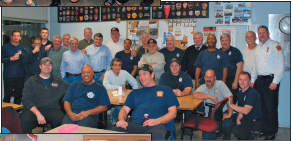
Fort Hill Reunion