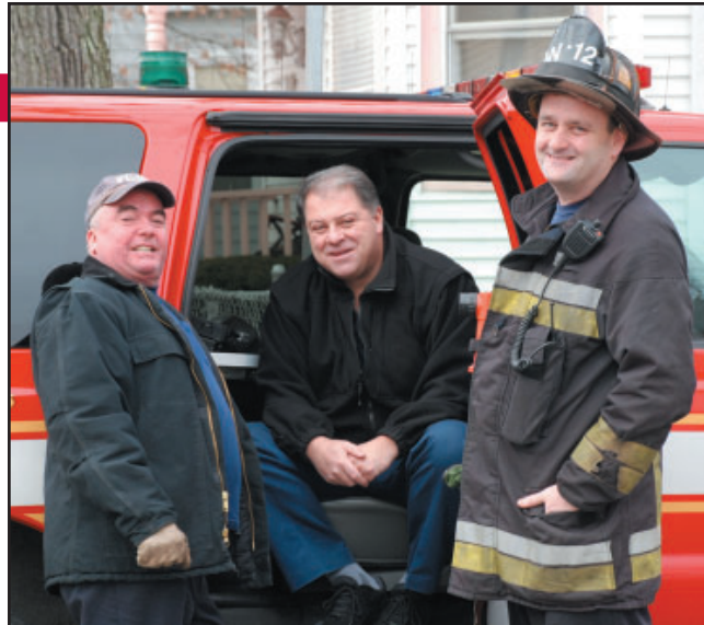
W-12 and TAC COM