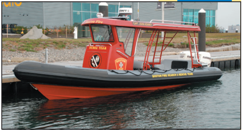
The Captain John F. Kenney

Headquartered in Marblehead, Massachusetts, RIBCRAFT designs and builds safe, durable, performance oriented rigid inflatable boats (RIBs) that fulfill the most demanding professional and recreational applications. A leading manufacturer of professional grade RIBs and inflatables for safety professionals, military agencies, yacht clubs, and tour operators throughout the world, RIBCRAFT offers vessels starting at 14' capable of fulfilling most any mission. www.ribcraftusa.com