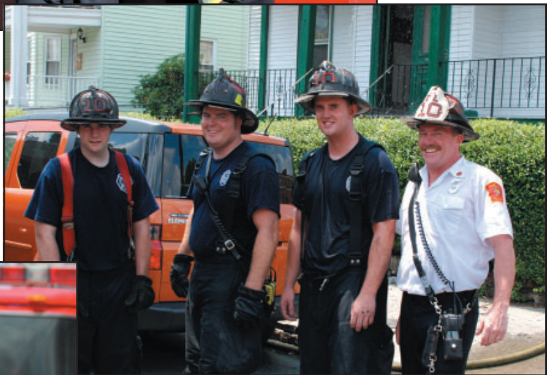
Tower Ladder 10