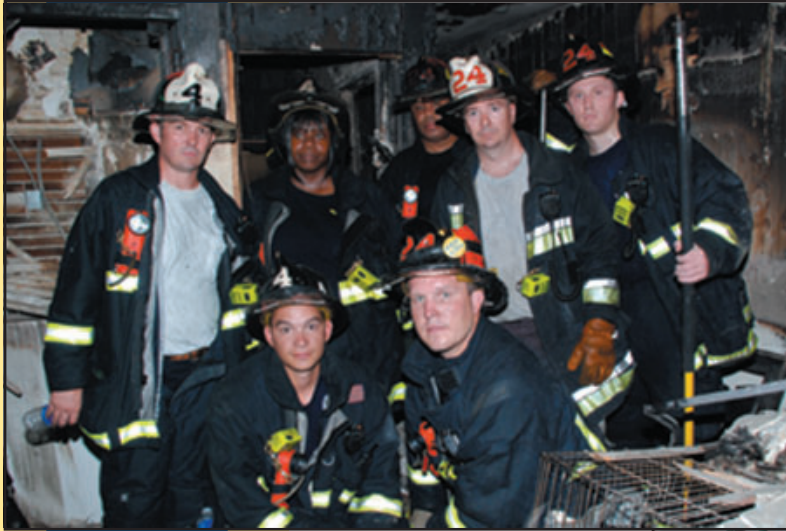
Engine 4 and Ladder 24