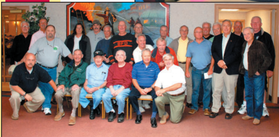
Engine 3, Ladder 3 and Aerial Tower 1 members reunite at Florian Hall