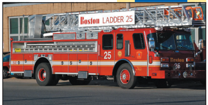
Ladder 25 Rehab