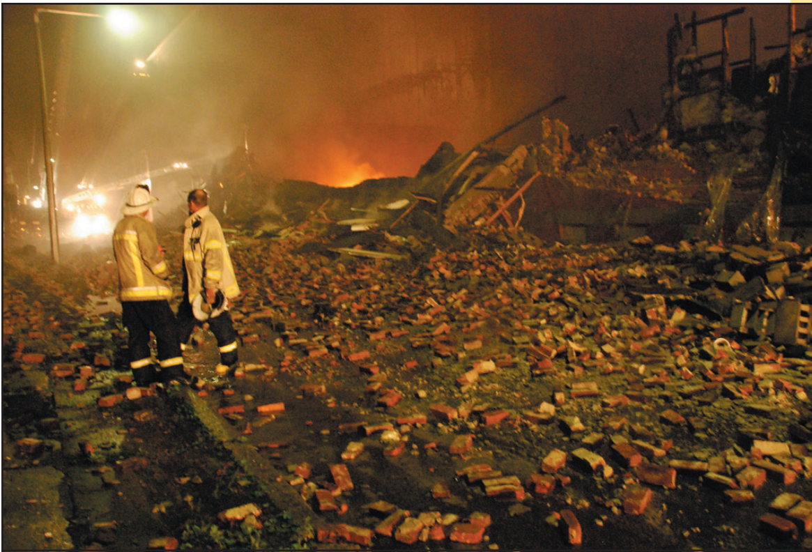
Moments after the Incident Commander ordered no one to enter the building, a partial collapse.