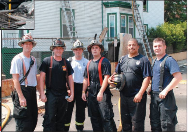
Engine 37 and Ladder 26