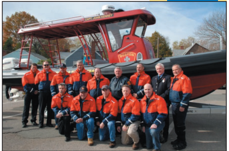
The Boston Fire Rescue Dive Team