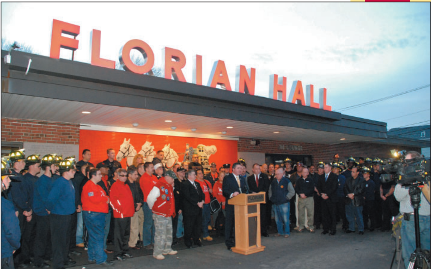
Boston Firefighters Local 718 stood with New York Firefighters and First Responders to urge the U.S. Senate to pass the Zadroga Act for 9/11 responders.