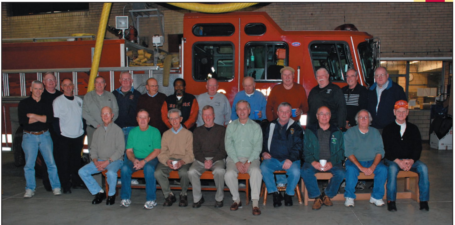
Some retirees gather at Engine 16 recently to catch up.