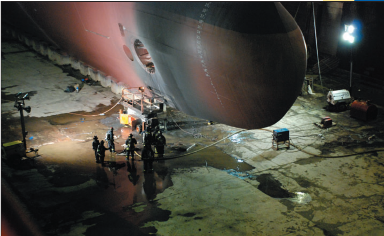
Firefighters were called to a drydock on the South Boston waterfront for a fire at a ship under repair on May 31, 2009. Special challenges were presented to firefighters to extinguish the fire.