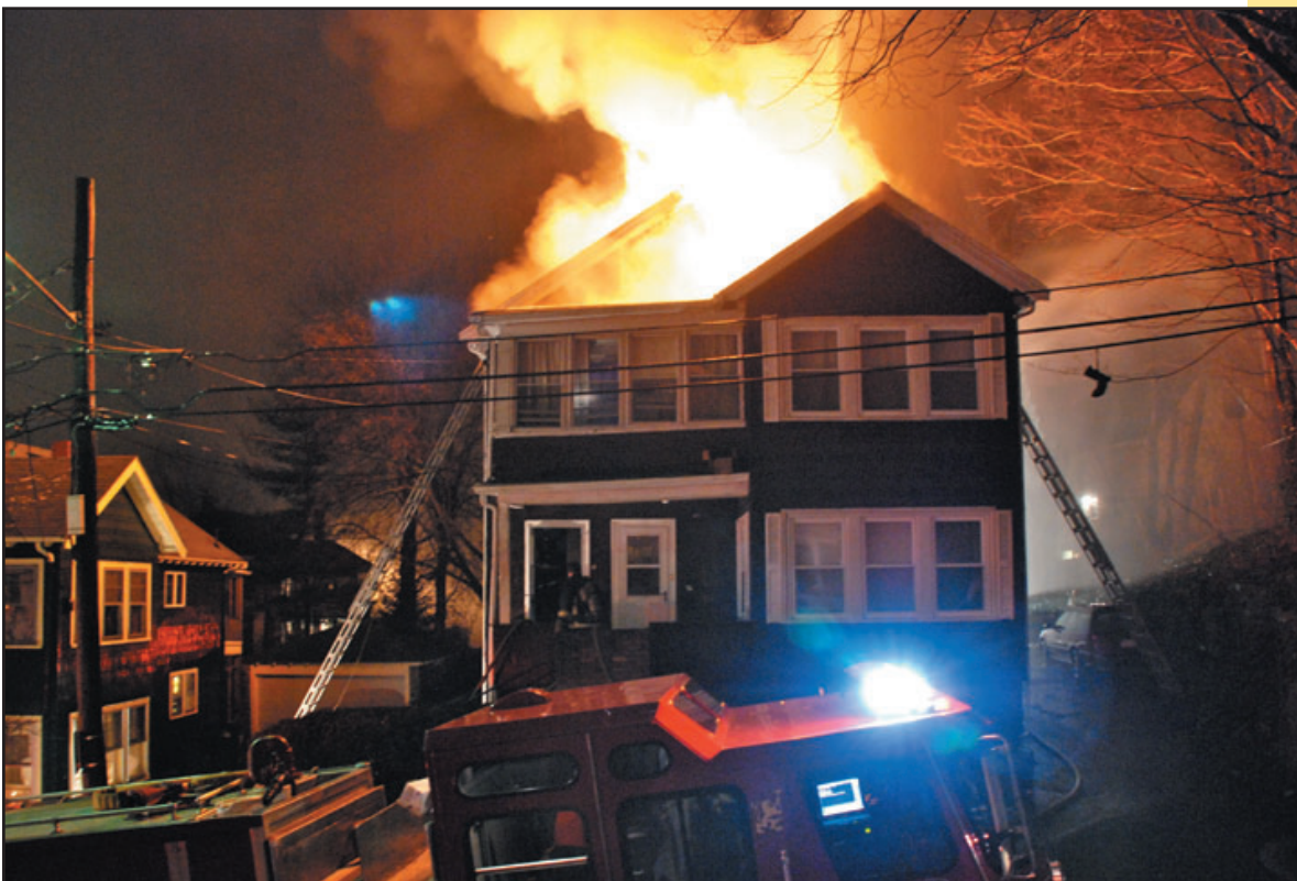
Two alarms were struck at 33 Dickinson Street in Brighton.