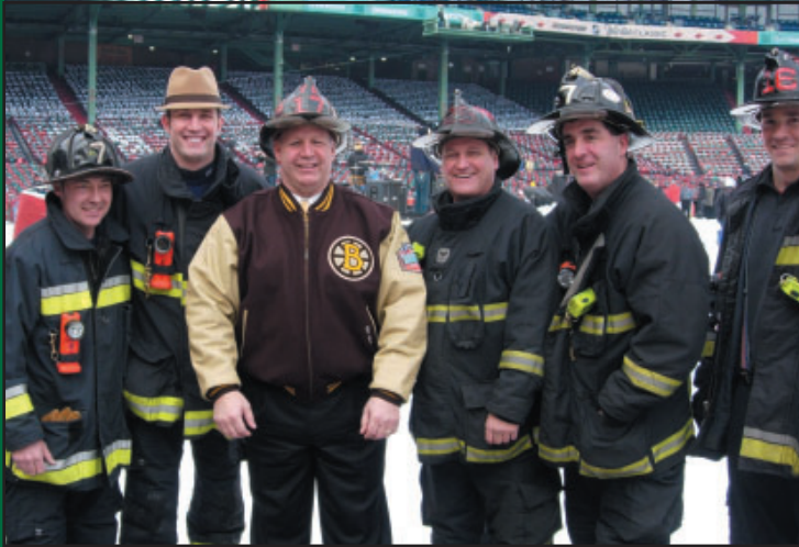
Boston Bruins Coach Claude Julian (3rd from left) poses with some of Boston's Bravest.