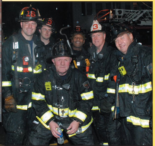
Tower Ladder 3 & Rescue 1