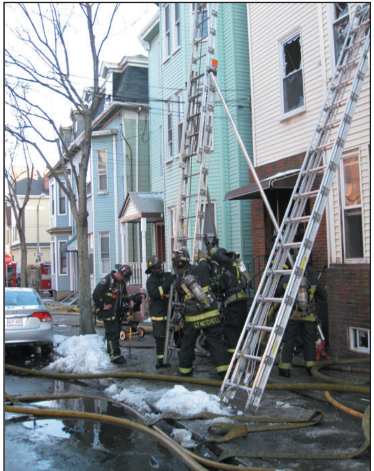
Ladder 26 makes up a 40 foot ladder to the top floor.