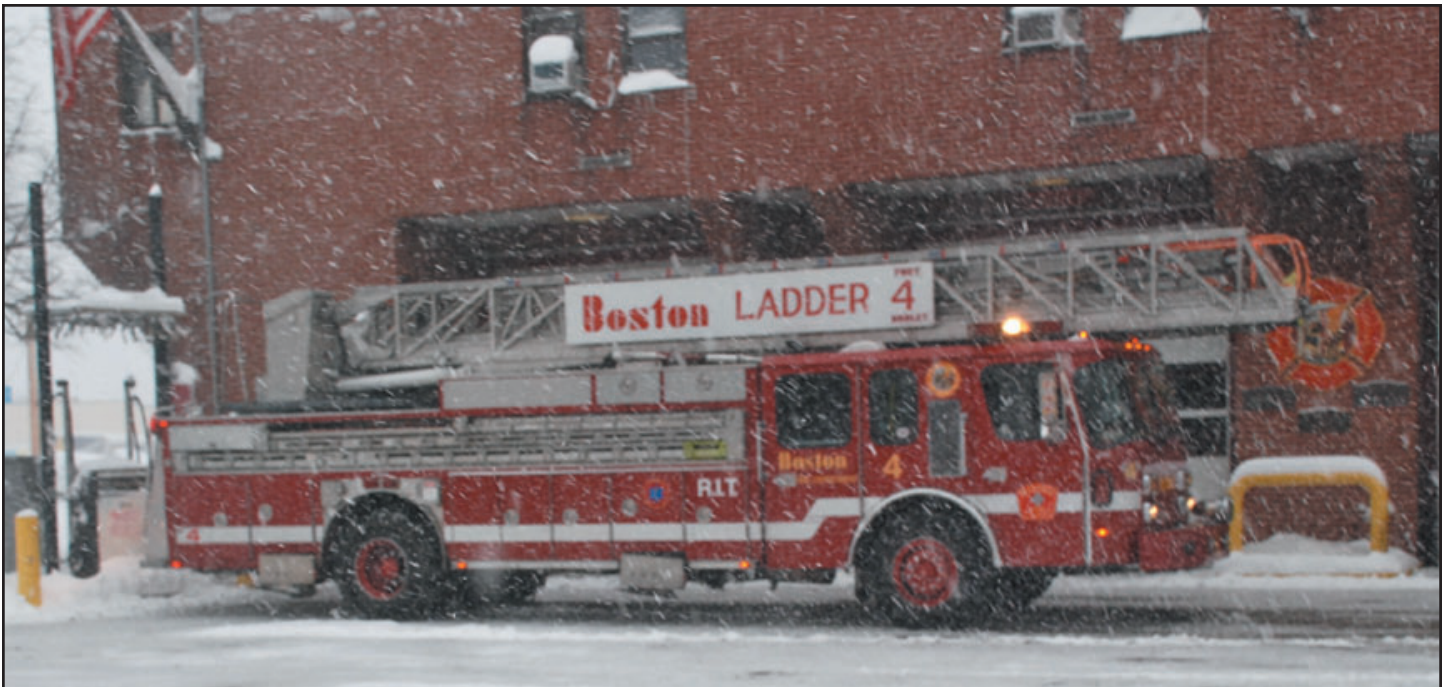
Ladder 4 rolls through the snow.

I do not apologize to anyone for being a firefighter and trying to support my family. All of us should remember what we do matters. We help people in their darkest hours and that is something special.