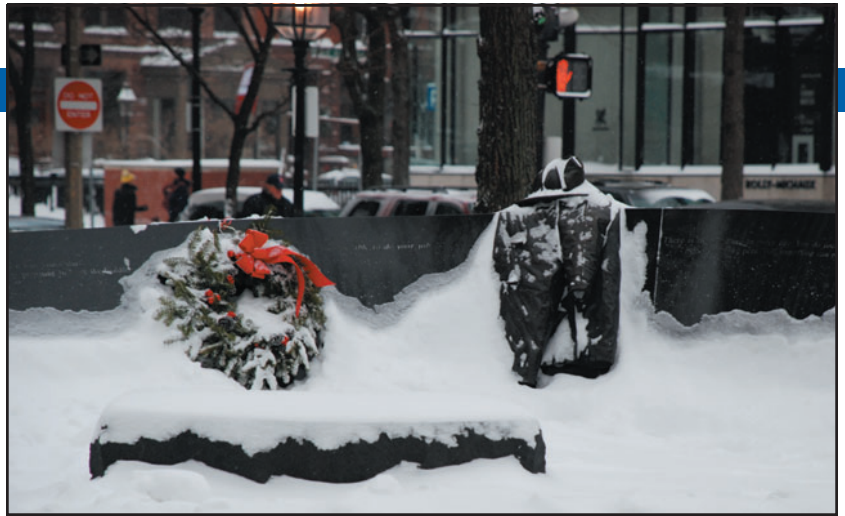
The Vendome Firefighters Memorial covered in snow.